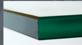
· Flat Polish