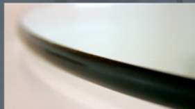
· Pencil Polish

Glaz-Tech is a major leader in manufacturing and distribution of beveled glass and mirror. Utilizing state of the art machinery, we're able to produce and emphasize on quality edgework.