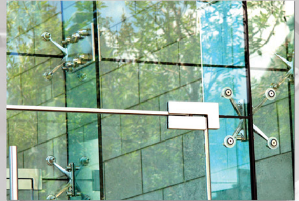
Ideal for holes, hinges and notches.