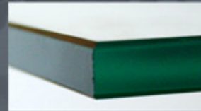
· Flat Polish