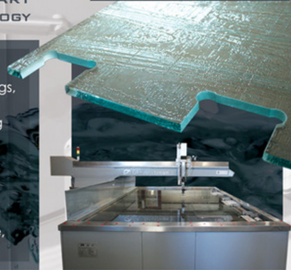
Pine Vue Sample : 3/8" Glass