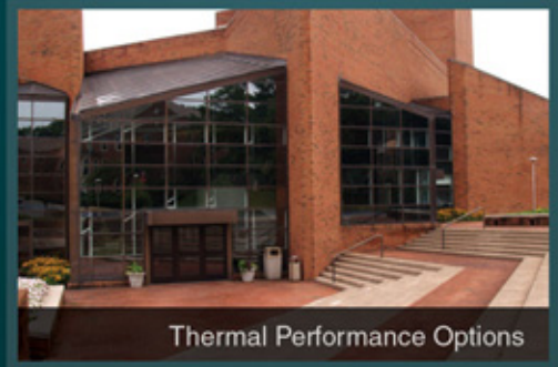
Thermal Performance Options

Factoring the appearance of your business along with energy efficient performance values to save you money is important. That's why Glaz-Tech Industries offers a vast variety of options for you to choose from. As a leader in commercial and architectural glass, GTI offers a broad range of performances and appearances to accommodate your design requirements. Options such as low-e coatings, tinted glass, reflective coatings or laminated applications are always available. GTI strives for the balance between solar energy control and energy savings.