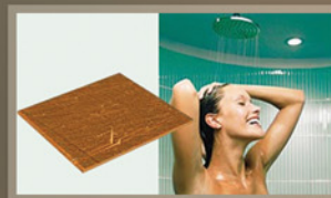
Magnified ShowerGuard® glass after exposure to typical shower conditions.