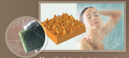
Magnified standard shower glass showing corrosion after exposure to typical shower conditions.