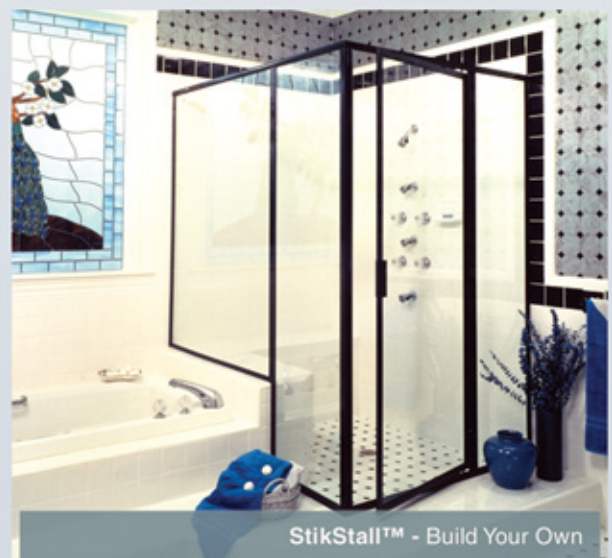
StikStall™ - Build Your Own