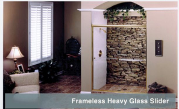
Frameless Heavy Glass Slider

Today's market calls for availability not limitations on every level of glass, hardware and design. With that in mind, Glaz-Tech Industries introduces Alumax Bath Enclosures . Glaz-Tech's integrated fabrication capabilities, alongside with Alumax's dynamic product line, gives you far more options for basic or highly complex designed enclosures. A shower enclosure's elegant presentation says a lot about the craftsmanship and the owner. Go with a certified distributor that fabricates quality product and provides endless ideas for even the simplest bath enclosure.