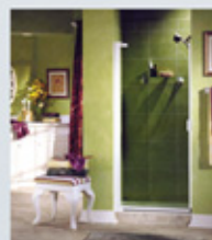
Pivot & Hinge Shower Door Models