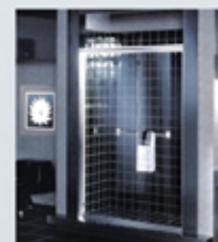
Sliding Shower Door Models