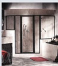
StikStall™ Shower Door Models