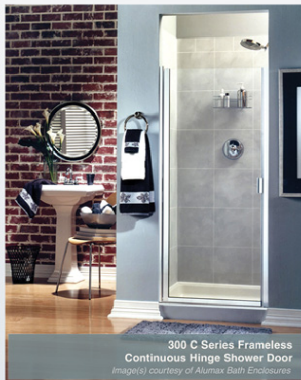
300 C Series Frameless Continuous Hinge Shower Door