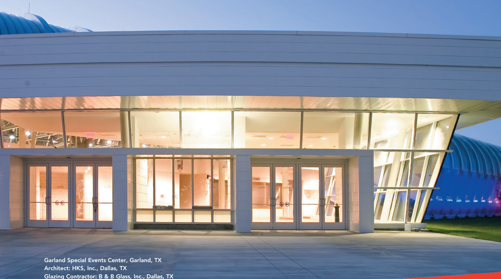
Garland Special Events Center, Garland, TX Architect: HKS, Inc., Dallas, TX Glazing Contractor: B & B Glass, Inc., Dallas, TX

Single Source Packages Generate Versatile First Impressions